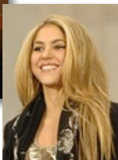
Shakira Barefoot Foundation 2010 Leader of Change