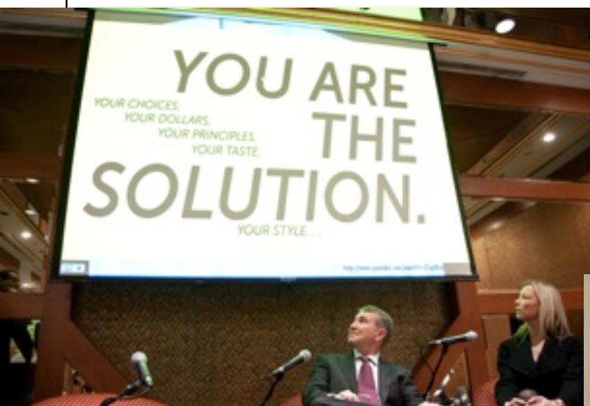
United Nations Global Conference for Social Change November 18-19, 2010 | New York City